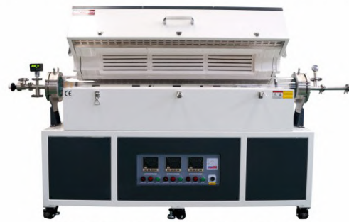
1200°C Three Zones Split Tube Furnace