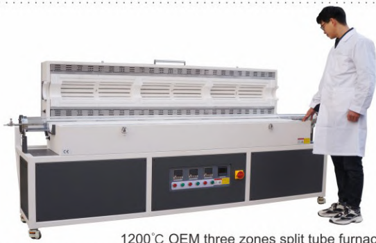
1200°C OEM three zones split tube furnace