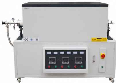
1700°C three zones Non-split tube furnace