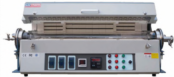
1200°C three zones split tube furnace